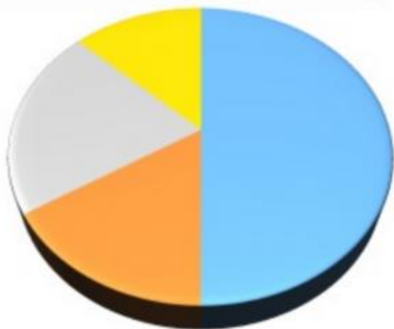
Cause of Infant Death in Metro KC from 2012-2016