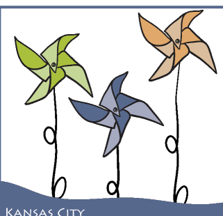
CHILD ABUSE ROUNDTABLE